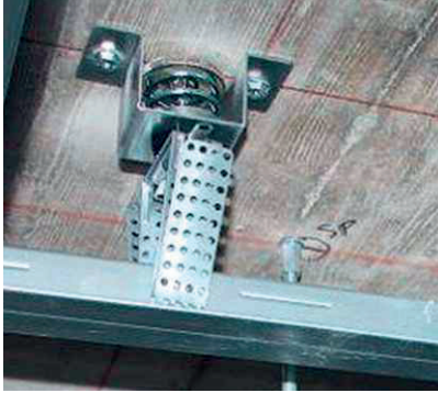
Spring hangers for suspended ceilings with a low natural frequency