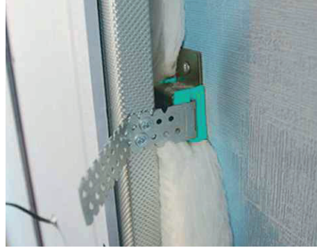
Dry lining decoupled with Sylomer® for high damping efficiency