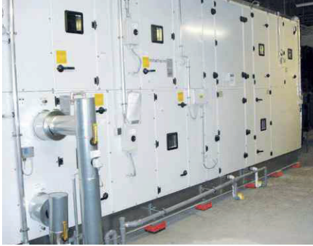
Air conditioning (AC) systems bedded on Isotop® SE elements.