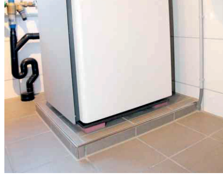
Sylomer® discrete bearings for a heat pump