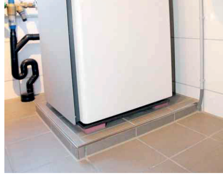
Sylomer® discrete bearings for a heat pump